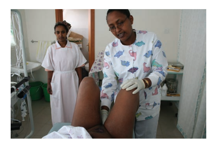
Figure 9.1 Teaching pelvic floor exercises at the Addis Ababa Fistula Hospital.