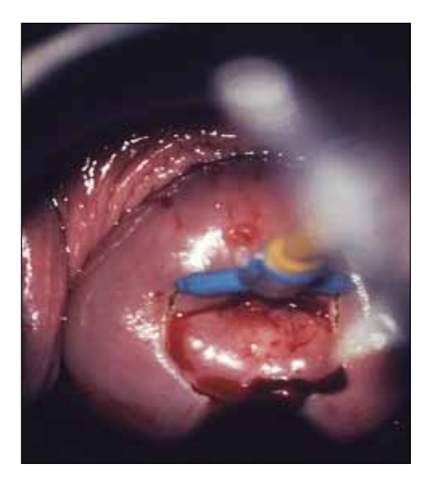
Figure 1 Loop cervical biopsy

a small but significant risk of late miscarriage and premature labor due to cervical incompetence. Therefore, women who have had two or more loop excisions should be closely monitored by an obstetrician throughout the pregnancy. In the first and second trimesters, the cervical length should be measured at regular intervals with a transvaginal ultrasound scan. The internal cervical os should also be assessed to exclude 'funneling'. If there is evidence of cervical shortening with or without 'funneling', a cervical suture may be inserted in either the late first trimester or early second trimester to prevent premature labor.