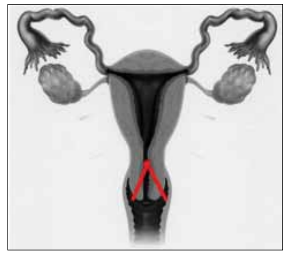
Figure 2 Diagram showing the part of cervix where a cone biopsy is performed

The risk of lymph node metastases at this stage is about 5–7.5%. No consensus exists regarding the optimal management of stage 1a2 cervical cancer. Treatment options include: