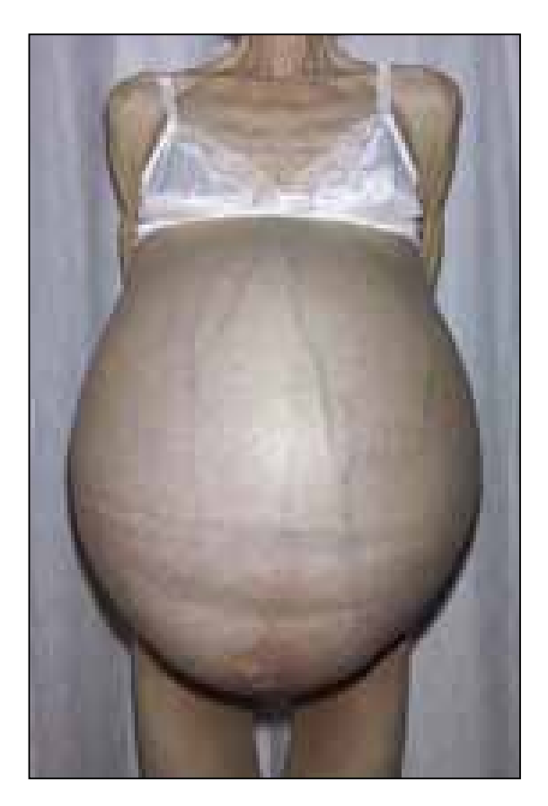
Figure 5 Ovarian tumor and ascites causing markedly distended abdomen with prominent veins, evidence of weight loss and stretched out skin

Ovarian cancer (Figures 4 and 5) was the second most common gynecological cancer in the UK with a total of 6806 cases in 2005, and 4407 deaths in 2006<sup>1</sup>. In the US, there were 20,095 new cases of ovarian cancer in 2004 and 21,650 cases in 2008; the condition was responsible for 15,520 deaths in 2008<sup>22</sup>. Given these numbers, ovarian cancer causes more deaths than any other cancer of the female