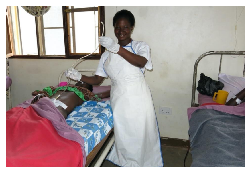
Figure 62 Checking if catheter is blocked

If the catheter is not draining, it may need to be flushed. To do this a sterile 60 or 100 ml catheter tipped syringe is needed with a sterile receiver (kidney dish) and some normal saline. It is useful to have a few sterile packs containing a receiver and syringe ready for use if