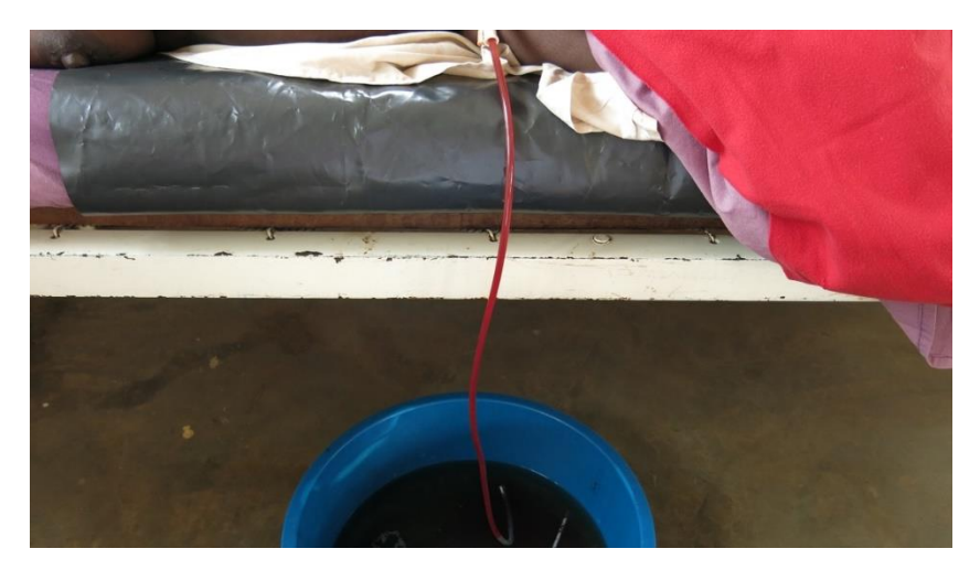
Figure 64 Bloody urine

and debris in the catheter can cause the catheter to block. Make sure the patient drinks more and that they have an attendant providing them with ample fluids. The patients should be encouraged to drink until the urine in the tubing becomes clear.