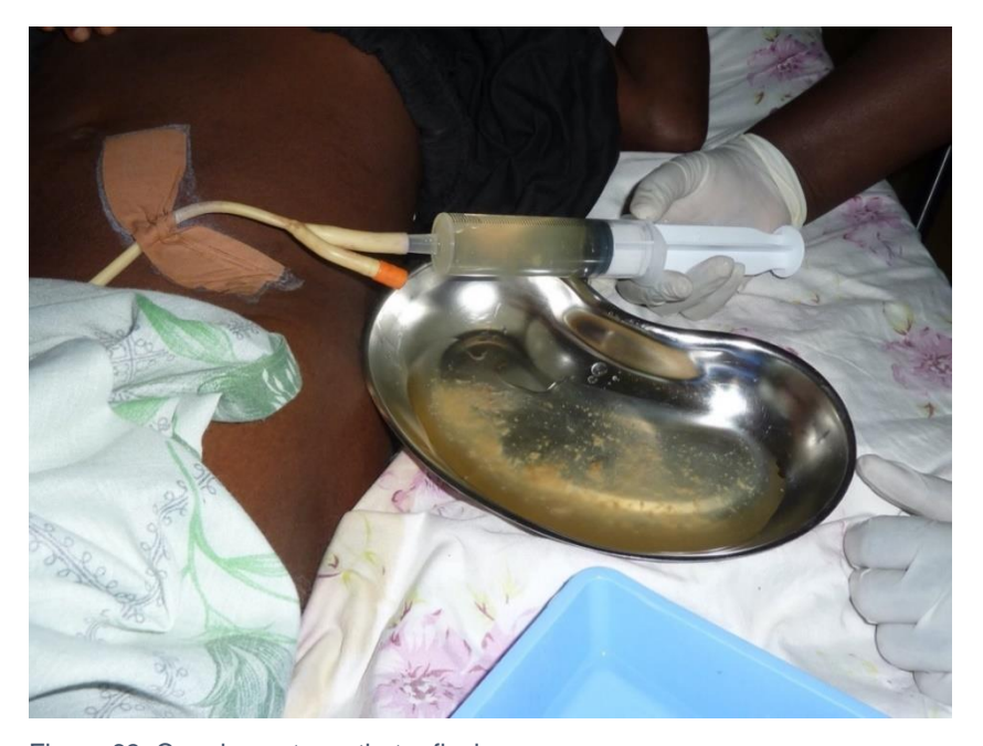
Figure 63 Carrying out a catheter flush

A catheter flush involves gently pushing 25 ml of saline through the urinary catheter to dislodge any clots or debris that may be blocking the catheter, then reattaching the catheter tubing and allowing it to drain freely. There can be a temptation to pull back on the syringe during irrigation, but this should be avoided, as it may inadvertently cause injury to the repair site in the bladder wall if the catheter balloon is sitting near the wound.