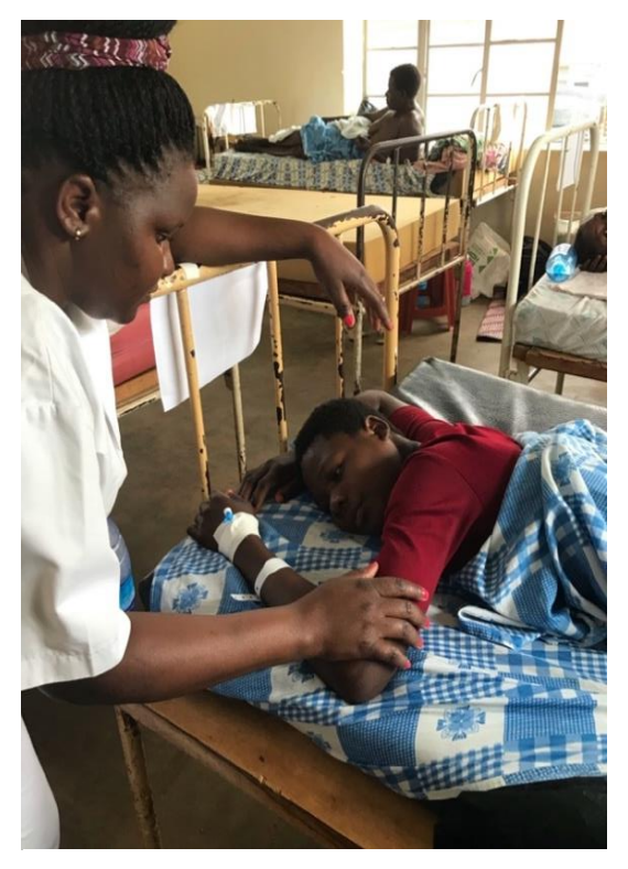
Figure 65 Patient being nursed prone

Nursing these patients prone can help promote healing, as the wound at the base of the bladder will be uppermost with the catheter tip below (sump drainage). This involves keeping the patient in bed, lying