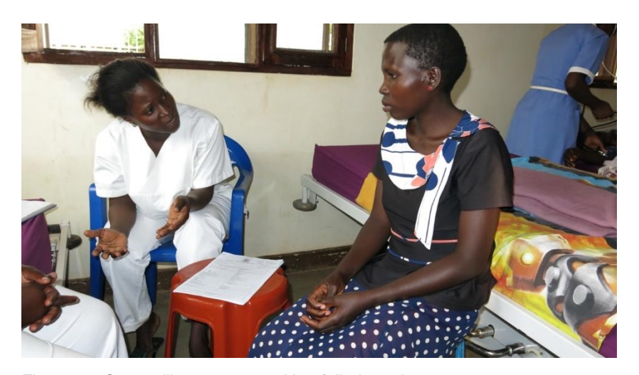
Figure 67 Counselling a woman with a failed repair

These women will need a lot of care and empathy to support them through the difficult period of coming to terms with going home continuing to experience the incontinence for which they initially attended. Some of them will go back home with a residual fistula smaller than the one they arrived with, so their incontinence may be less. They need to be advised when they can re-attend for surgery.