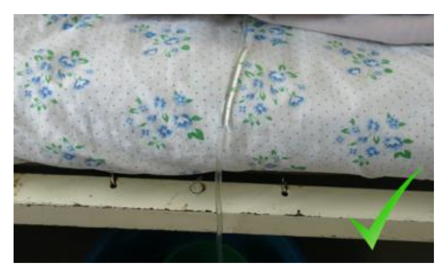
Figure 51 Clear urine