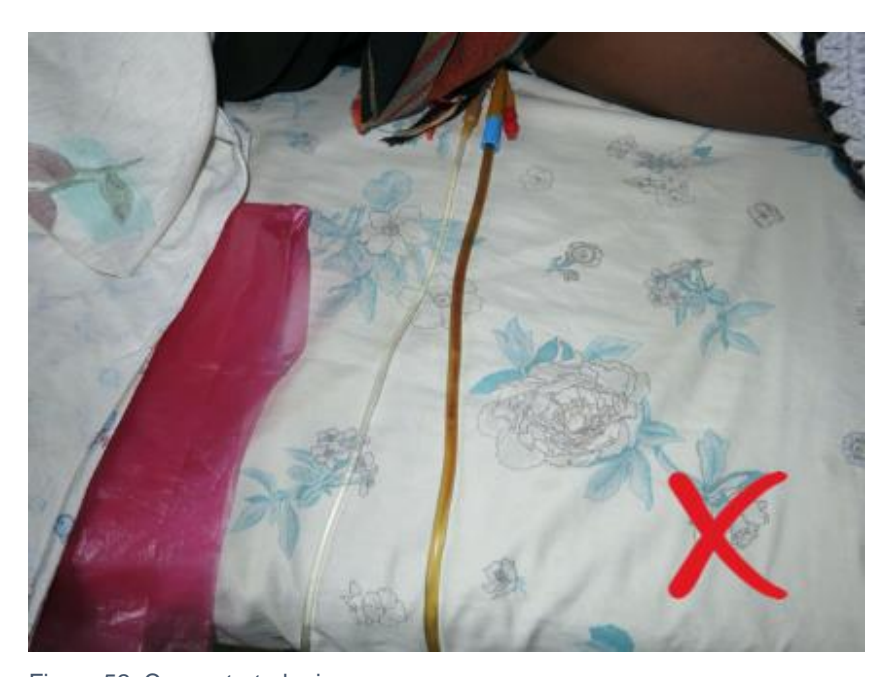
Figure 52 Concentrated urine

All patients will return from theatre receiving IV fluids. These can be stopped when the patient is drinking, and the urine is clear. However, some patients may experience nausea after a spinal or general anaesthetic. These patients will need the IV fluids to continue until