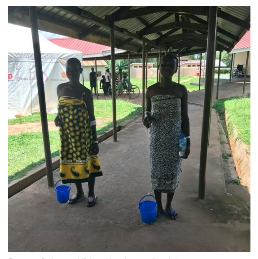
Figure 47 Patients mobilising with catheter on free drainage

Closed drainage systems are available such as the urimeter bag, but these are expensive and rarely available in most hospitals. They also require vigilant nursing care to empty the measuring chamber hourly and record on a fluid balance chart.