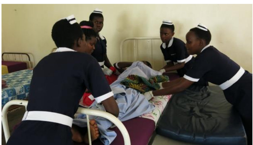
Figure 40 Transferring a patient from trolley to bed using a slide sheet