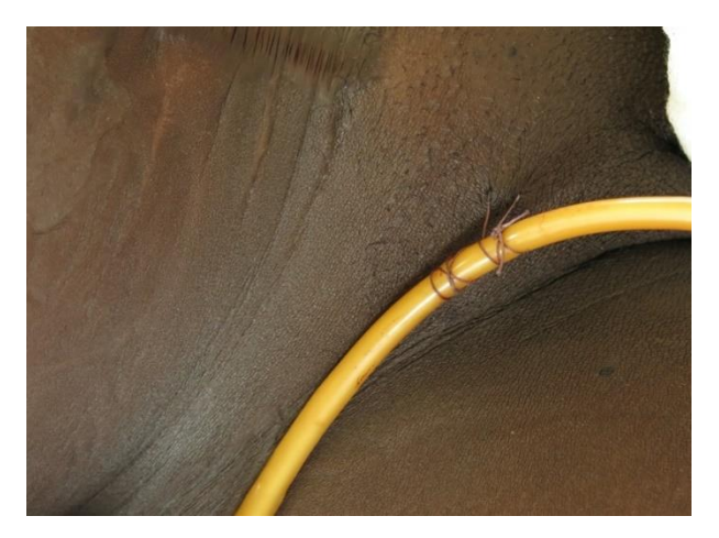
Figure 44 Catheter secured with a suture to the mons pubis

Patients may occasionally return from theatre with the catheter secured by a suture to their mons pubis. This is entirely acceptable, although strapping will also be required in addition to the suture. However, the patient may start to complain that the suture is causing pain once they are mobile. If this is the case, then at this stage it is best to remove the stitch for patient comfort, but it is essential to ensure the catheter is adequately secured with strapping.