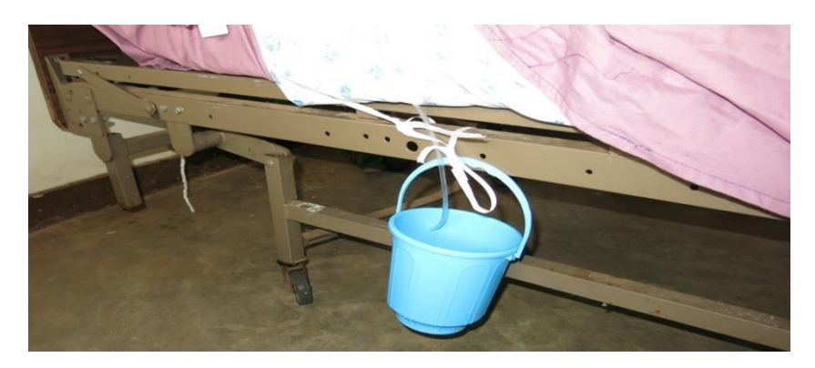
Figure 45 Bucket tied to bed, can cause pulling on the catheter

It is important to prevent the patient from tying the catheter to their bed, as this is likely to pull on their bladder when they move around in bed. Patients need to know that the bucket should be on the floor if