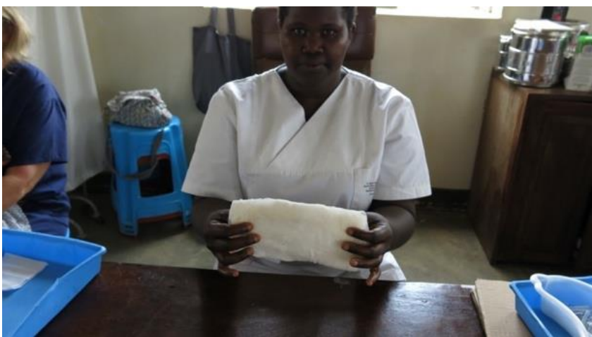
Figure 60 Making pads from gauze and cotton wool