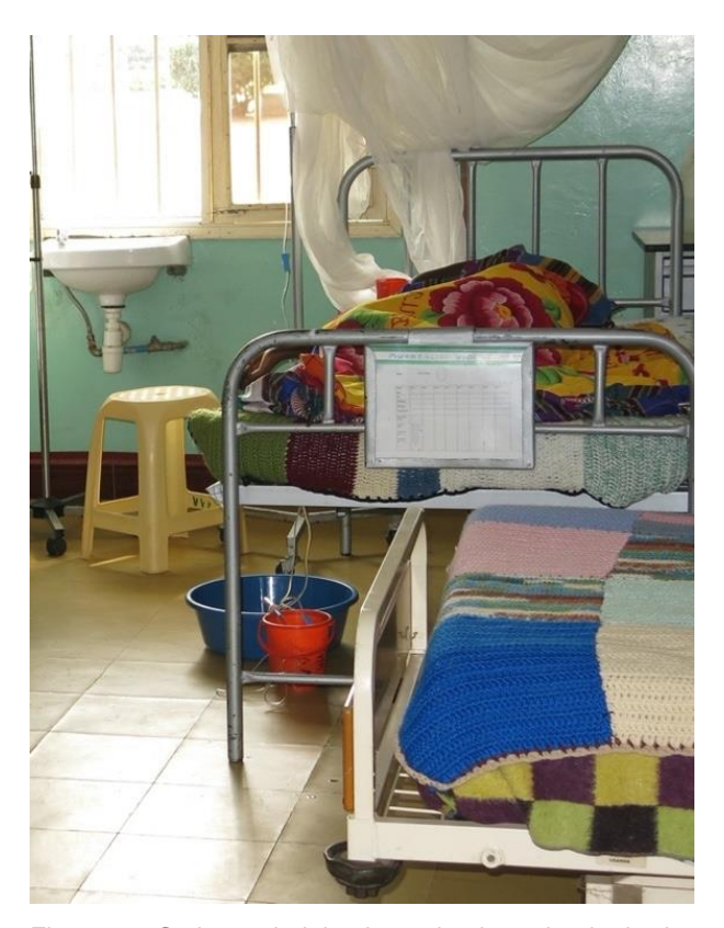
Figure 41 Catheter draining into a basin under the bed

The patient and her attendant should be advised to make sure the catheter is always draining and if they think it has stopped dripping, to inform the nurse on duty immediately. Overnight, the night nurse needs to check the catheters are all draining at least every hour, but this can be made more manageable by asking the patient's attendant to keep checking as well. Finding blocked catheters in the morning and failed repairs are common with poor nursing care, yet are entirely preventable.