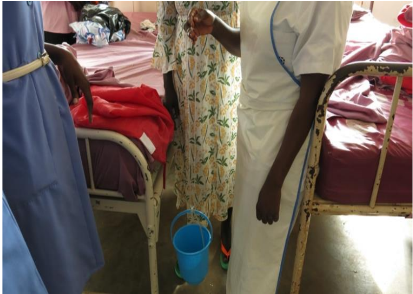
Figure 46 Making long bucket handles from used IV giving sets