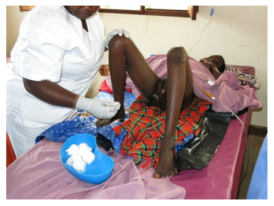
Figure 59 Removal of vaginal pack and daily perineal washing

During removal of the pack, the patient may experience some discomfort, but this will be temporary. Good lighting is needed to inspect the pack after removal for any sign of infection or fresh bleeding. It is important to ensure that there is no gauze left in the vagina, as this can be a source of post-operative infection and lead to break down of the repair.