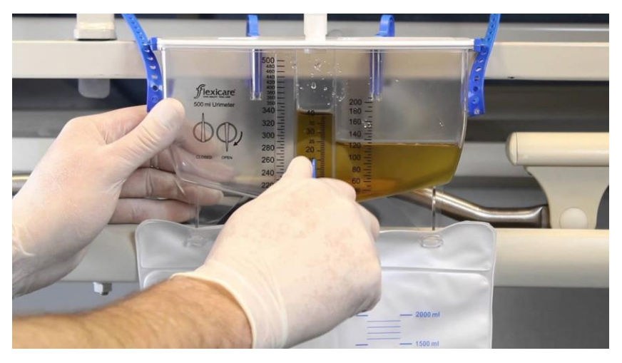
Figure 48 Urimeter in use to measure urine output

empty the bag when it fills up. Most of these patients will have the catheter removed the next day and be encouraged to mobilise.