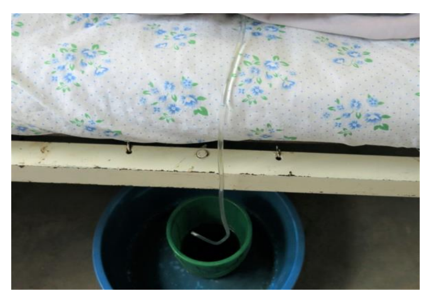
Figure 42 Catheter on free open drainage

To protect the bladder repair site, the catheter should not pull on the bladder. To avoid any pulling of the catheter, it should be securely strapped to the patient, preferably on the abdomen or thigh. This is when the nurses need a good supply of strapping and should check the patient's catheter is secure every morning before they get out of