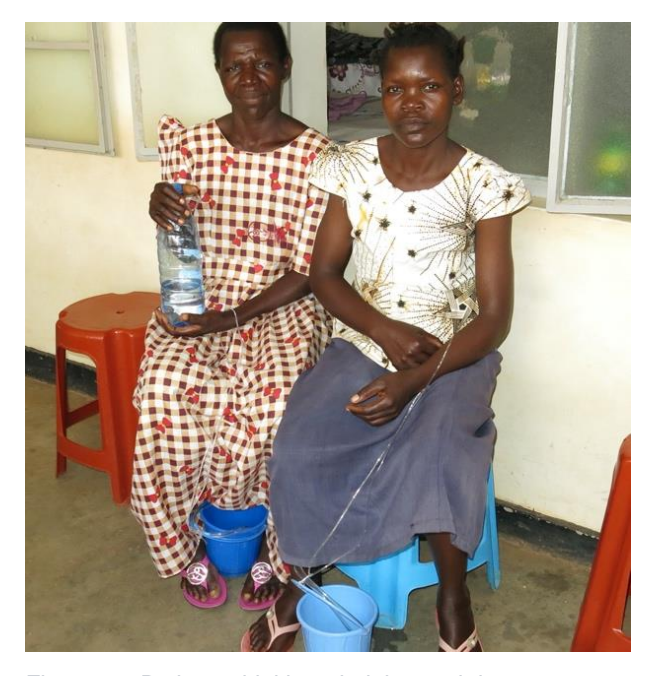
Figure 57 Patients drinking, draining and dry

Once patients are stable and mobile, a daily temperature, blood pressure and pulse should be taken to observe for any sign of infection over the next few days or weeks. Early detection and prompt intervention with antibiotics will hopefully prevent any breakdown of wounds which can lead to failed repairs.