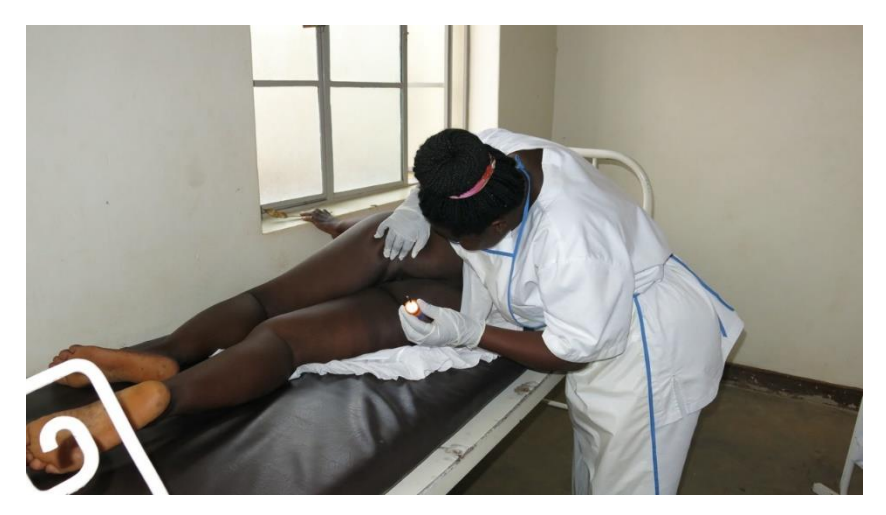
Figure 58 Daily wound check on perineal tear operations

breakdown if the wound is not kept clean and dry. It is important to stress to patients the importance of keeping the wound clean. This is because some patients may fear and thus resist cleaning the wound as they are worried about touching the stitches.