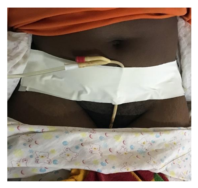
Figure 43 Catheter secured to the abdomen

To protect the bladder repair site, the catheter should not pull on the bladder. To avoid any pulling of the catheter, it should be securely strapped to the patient, preferably on the abdomen or thigh. This is when the nurses need a good supply of strapping and should check the patient's catheter is secure every morning before they get out of