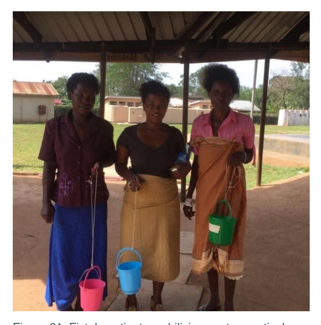
Figure 61 Fistula patients mobilising post-operatively

3rd and 4th degree tear patients will have their vaginal pack and catheter removed the day after their surgery and be up and walking. If there is a shortage of beds on the fistula ward, these patients can be moved to other wards to be looked after as they will require little care once they are mobile.